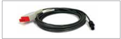
Low Level Output Cable - Interface to GE Monitor - 14' (426.7cm) 0012-00-1589-04