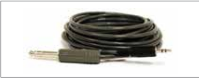
Cable Interfaces BP for Philips Viridia & BP & ECG for Spacelabs PC series monitors - 30' (914.4cm) 0012-00-0822-02