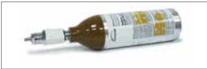
Helium Tank - UK / France - Reusable - Pack of 3 Tanks 0075-02-0001-03