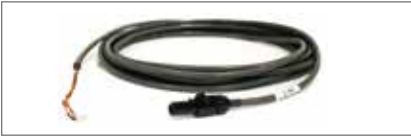
Low Level Output Cable - Unterminated 15' (457.2cm) 0012-00-1589-01 23' (701cm) 0012-00-1589-05