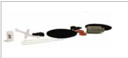
Preventive Maintenance Kit - 2,500 Hour 0040-00-0146