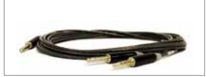
Cable Interfaces BP & ECG for Siemens monitors with 1/4" stereo phone plugs - 30' (914.4cm) 0012-00-0821-02