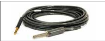
Cable Interfaces ECG for Spacelabs PC series monitors with TT-253 plugs, RoHS - 30' (914.4cm) 0012-00-0826-03