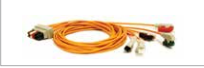
ECG ESIS Leadwires - 5 Lead - Pinch Type - 50" (127cm) - AAMI 0012-00-1157-01