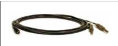
Cable Interfaces BP & ECG for Marquette 7000 series monitors - 30' (914.4cm) 0012-00-0824-02