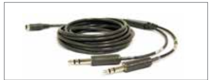
Cable Interfaces Datascope Spectrum/OR monitors to ECG & IBP Sync of IABP - 15' (457.2cm) 0012-00-1650-01