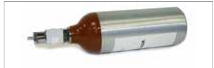
Helium Tank - Reusable - Pack of 3 Tanks - Empty 0075-00-0034-03