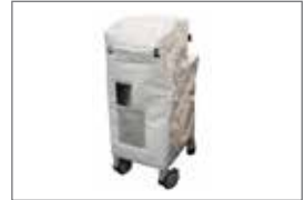
Protective Cover 0198-00-0023