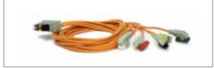
ECG ESIS Leadwires - 5 Lead - Pinch Type - 50" (127cm) - IEC 0012-00-1157-02