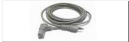
AC Line Cord - 220v - Brazil - 16' (4.9m) 0012-00-0886-04