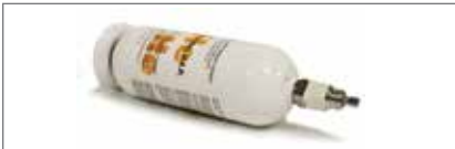
Helium Tank - Disposable - Single Tank - Full 0202-00-0104