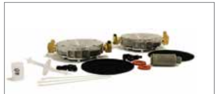
Preventive Maintenance Kit - 5,000 Hour 0040-00-0147