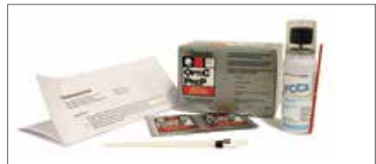
KIT-CLEANING Fiber-Optic Cleaning Kit