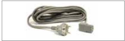
AC Line Cord - 220v - International - 16' (4.9m) 0012-00-0886-02