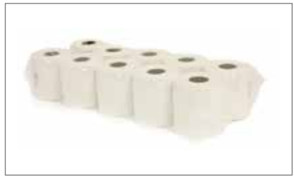
Recorder Paper 0683-00-0422-02 Package of 10 rolls