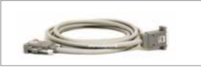
Remote Monitor Extension Cable - 10' (304.8cm) 0012-00-1212