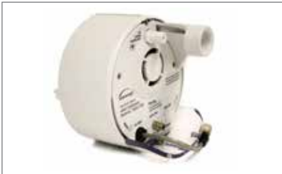
Condensate Removal Module 0997-00-0986-01