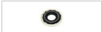
Washer - Helium Tank, 1 pc. 0348-00-0185