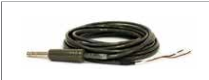
External Signal Cable - Unterminated 15' (457.2cm) 0012-00-0323