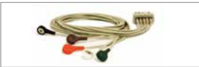
ECG Leadwires - 5 Lead - Snap Type - 50" (127cm) - AAMI 0012-00-1156-01