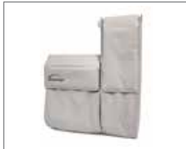
Assembly, Accessory Storage Pouch 0997-00-0428