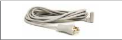
AC Line Cord - 110v - United States - 16' (4.9m) 0012-00-0886-01