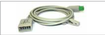
ECG Patient Cable - 5 Lead - 10' (304.8cm) - AAMI 0012-00-1155-01