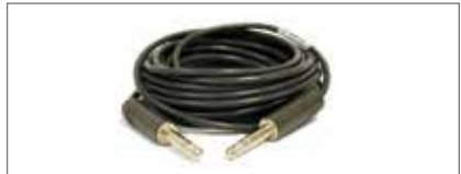
Cable Interfaces BP & ECG for HP/Philips Monitors, except CMS, Viridia or Intellivue - 20' (609.6cm) 0012-00-0819-01