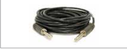
Cable Interfaces ECG for HP/Philips CMS, Viridia, Intellivue & MP series monitors , RoHS - 30' (914.4cm) 0012-00-0820-03