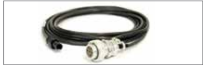
Low Level Output Cable - Interface to Datascope Monitor - 15' (457.2cm) 0012-00-1589-02