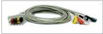
ECG Leadwires - 5 Lead - Snap Type - 50" (127cm) - IEC 0012-00-1156-02