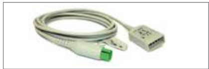
ECG Patient Cable - 5 Lead - 10' (304.8cm) - IEC 0012-00-1155-02