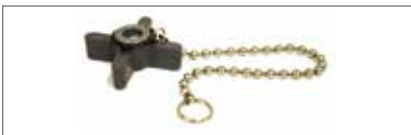
Valve Knob - Helium Tank - United States 0366-00-0092