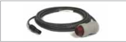
Low Level Output Cable - Interface to Philips Monitor - 14' (426.7cm) 0012-00-1589-03