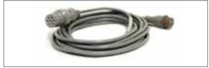
Interface Transducer Cable - 12' (365.7cm) 0012-00-1245