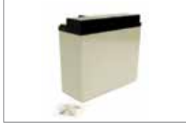
12v Battery - Single Battery Only - Sealed Lead Acid 0146-00-0039 Replace in pairs