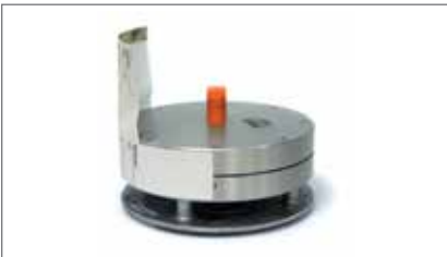
Safety Disk Assembly 0997-00-0985-01