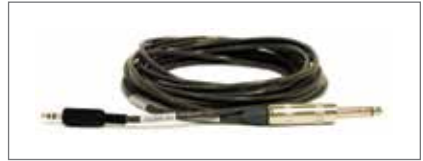
Cable Interfaces BP for Marquette 7000 series monitors - 30' (914.4cm) 0012-00-0823-02