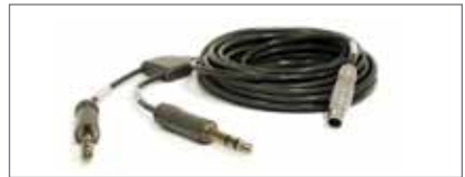
Cable Interfaces BP & ECG for GE Marquette monitors - 30' (914.4cm) 0012-00-0825-02